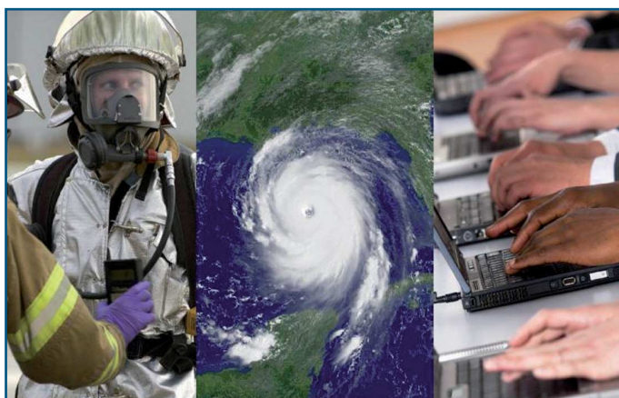
Disaster Image Collage

The Disaster Information Management Research Center (DIMRC) , a part of the Specialized Information Services Division helps prepare for, respond to, recover from, and mitigate the adverse health effects of disasters. The DIMRC site hosts a variety of tools and information resources including, Emergency Response and Toxicology Tools and Apps, Subject Guides, and Disaster Medicine and Public Health Literature.